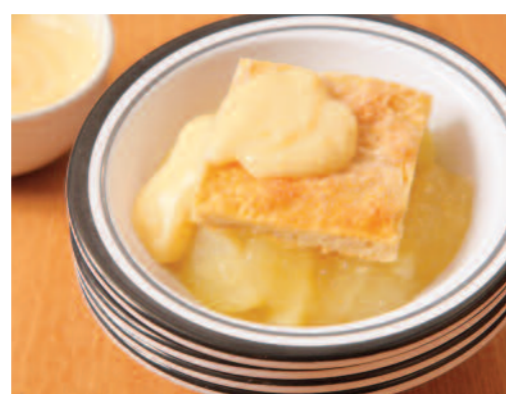
Apple Pie & Custard