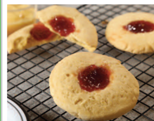
Jam & Custard Biscuit