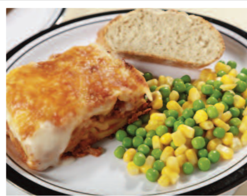
Beef Lasagne served with Garlic & Herb Bread and Seasonal Vegetables