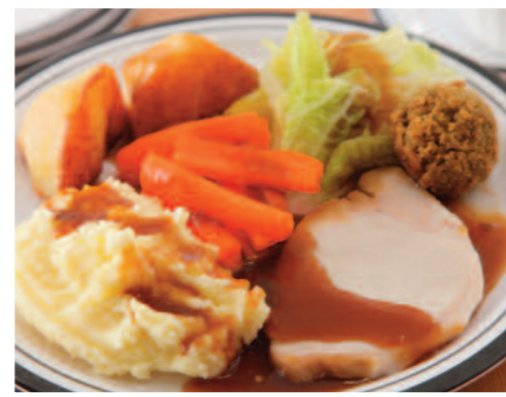
Roast Pork served with Roast/Mashed Potatoes, Seasonal Vegetables & Gravy