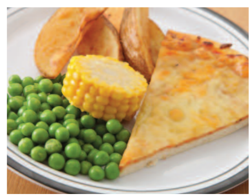
Cheese & Tomato Pizza, served with Potato Wedges & Seasonal Vegetables