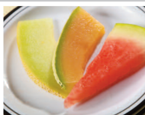
Trio of Melon