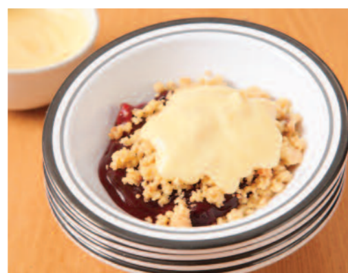
Fruit Crumble & Custard