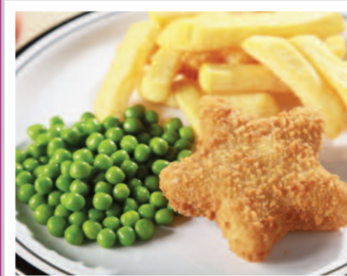
Fish Star (MSC) served with Chips & Peas or Baked Beans