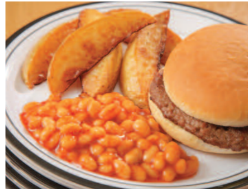
Beef Burger served in a Bun with Potato Wedges & Seasonal Vegetables or Baked Beans