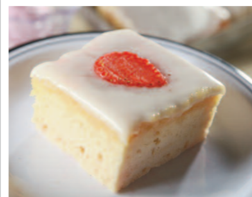
Strawberry Ice Cream Cake