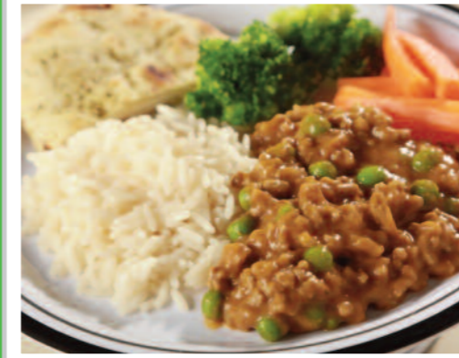
Beef Keema served with Rice, Naan Bread & Seasonal Vegetables